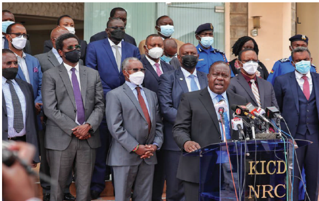
Cabinet Secretary Ministry of Interior and Coordination of National Government, Dr. Fred Matiang'i, leads Senior Government officials at a press address during the strategic meeting to chart a way forward towards achieving an Elections Bila Noma, on 24th Jan 2022