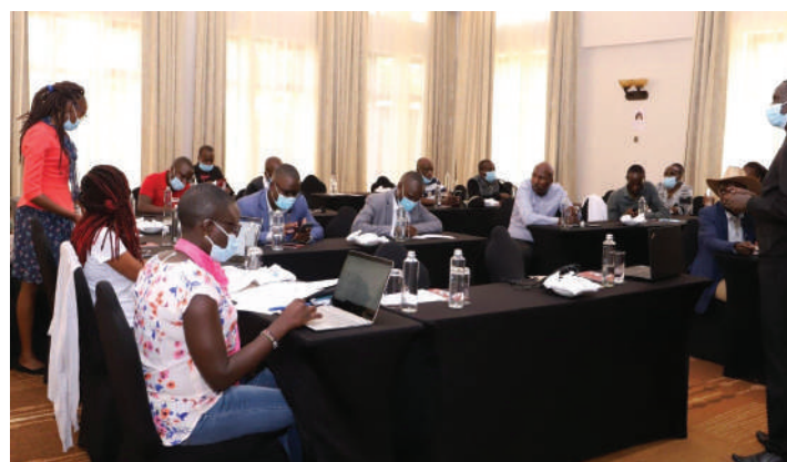
NCIC officials engage participants during the conflict mapping exercise in Meru County, on 15th February 2022

With six months to the August polls, NCIC has developed several strategies towards ensuring a peaceful electoral process, among them conducting a Conflict Hotspot Mapping exercise across the country. The exercise seeks to map out the likelihood of election violence across the country. As such, NCIC invited peace ambassadors and peace actors in general, to help analyze and understand the context of various communities, counties, regions, and country, and subsequently develop preventive and response strategies that would lead to the realization of an ‘Elections Bila Noma’.