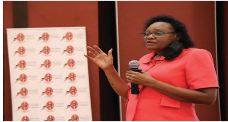
NCIC Commissioner Hon. Dorcas Kedogo addresses the audience during the CMD/NCIC partnership conference on 31st Jan 2022