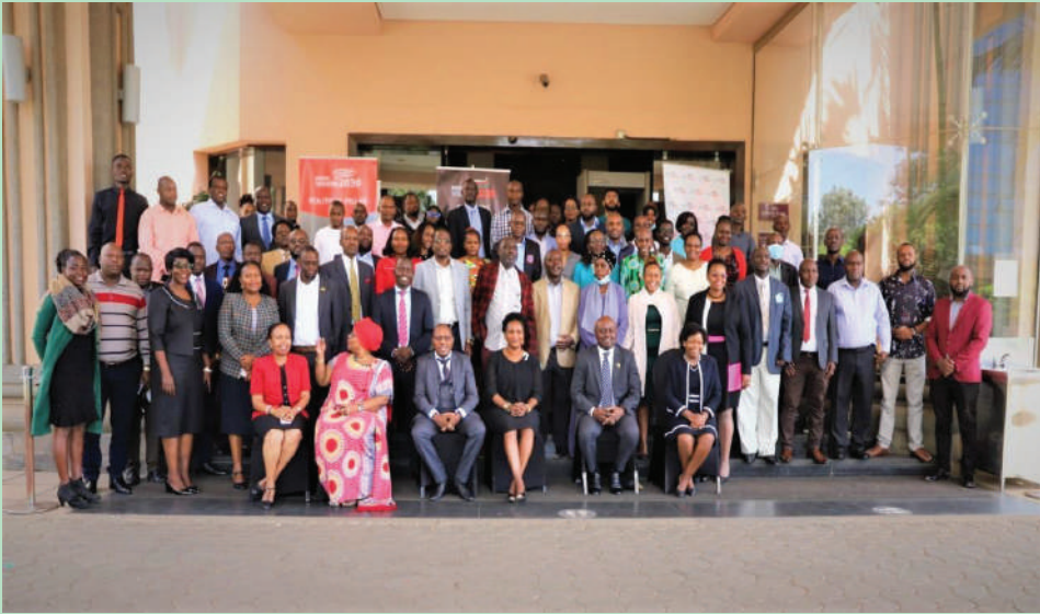
NCIC, ORPP and Vision 2030 officials during the Kenya Vision 2030 dialogue forum at the Crowne Plaza hotel, Nairobi on 26th Jan 2022.