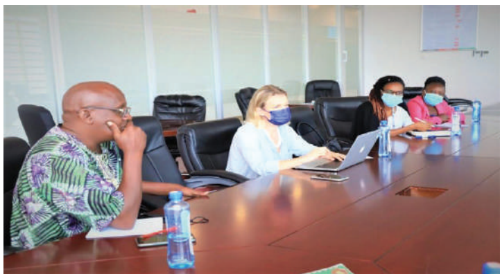
NCIC representatives engaging members of ECES and ELOG Kenya at the NCIC boardroom on 25th Jan 2022