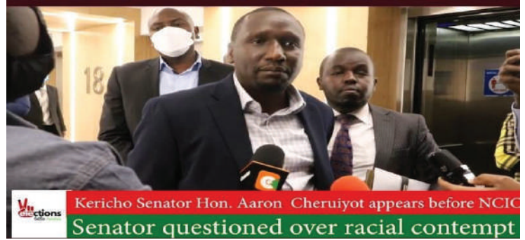
Senator Aaron Cheruiyot appearing before NCIC for questioning on 12th Jan 2022.

The Multi-Agency is chaired by the Ministry of Interior and Coordination of National Government. Department of Justice), Office of the Inspector