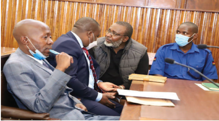
Senator Mithika Linturi awaiting a court ruling at a Nakuru Court on 26th Jan 2022

4. While addressing residents of Kisii, Kitutu Chache South MP Richard Onyonka made insightful remarks that could potentially evoke violence.